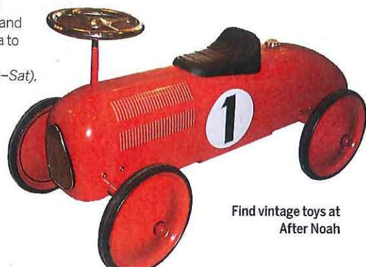
Find vintage toys at After Noah

Having started out as an antique furniture shop, After Noah have branched out into vintage and traditional toys, with a dedicated toy shop now open alongside the main store in Islington. Sit-on cars, prams and jointed teddy bears are among the goodies on offer. There are also plenty of jigsaws and games for rainy days and lights for children's rooms. Time: 10am-6pm (Mon-Sat), 12-5pm (Sun), 121 Upper Street, Islington N1 1QP. Tel: 020 7359 4281; www.afternoah.com Angel