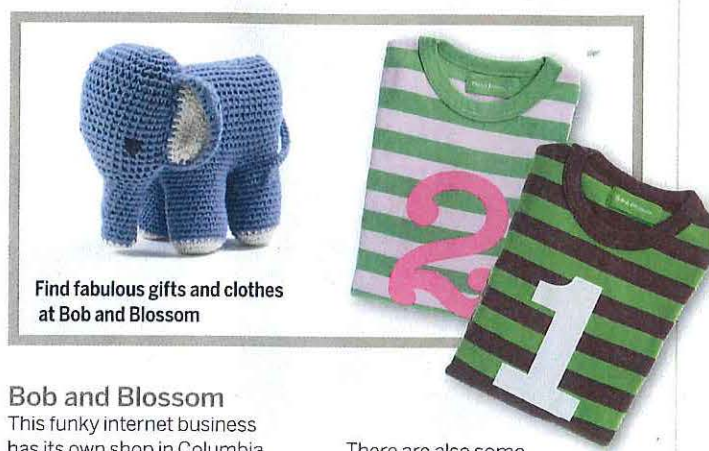
Find fabulous gifts and clothes at Bob and Blossom

For an extensive selection of stylish children's footwear, make a beeline for One Small Step, One Giant Leap. You'll find everyday shoes from Start-rite, Aster and Primigi; party shoes from Lelli Kelly, Pom D'Api and Mod 8; and cool trainers from Converse, Nike and Adidas. The store recently launched their own label, Max and May, which features Mary Jane styles in cool silvers and pinks. The shop also has a concession in Harrods with designer shoes from labels like Prada, Armani, D&G, Simonetta and Miss Bluemarine. East Sheen: 10am-6pm (Mon-Fri), 9am-6pm (Sat), 11am-5pm (Sun), 409 Upper Richmond Road West, East Sheen SW14 7NX. Tel: 020 8487 1288. Mortlake Harrods: 10am-8pm (Mon-Sat), 12-6pm (Sun), Knightsbridge SW1X 7XL. Tel: 020 7225 6896. Angel Knightsbridge For further details and branches, visit www.onesmallsteponegiantleap.com