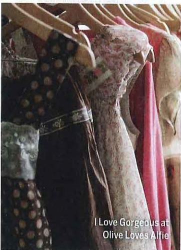
I Love Gorgeous at Olive Loves Alfie

There are also some charming toys, including cheeky crocs on wheels and musical sheep. Time: 9am-3pm (Sun), 140 Columbia Road, Tower Hamlets E2 7RG. Tel: 020 7739 4737; www.bobandblossom.com Angel Bethnal Green